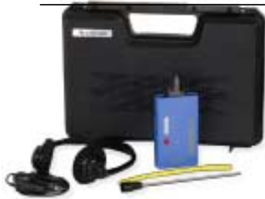
VPE KIT includes VPE meter, headset, waveguide, stainless steel probe and ABS carrying case.