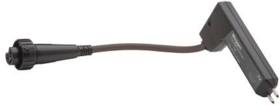
DTP1-C Duplex Twist Probe 1 - Connect Order part number: 1006-449