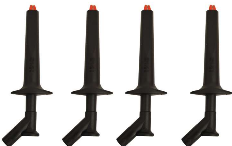
Optional Plunger Clips (1008-756)