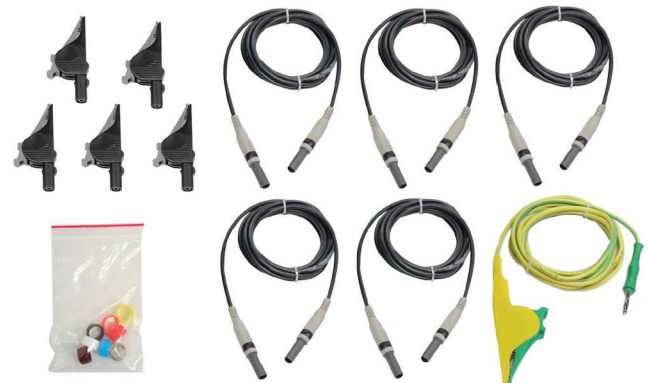
MPQ1000 Voltage Lead Set (2007-259)