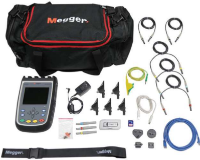
MPQ1000 Basic Kit C/N MPQ1000-BASIC

Includes MPQ1000 analyzer, voltage leads, SD card, USB cable, ethernet cable, universal power adapter, soft-sided carry bag plus fuse adapters and hanging strap. Does not include current clamps.