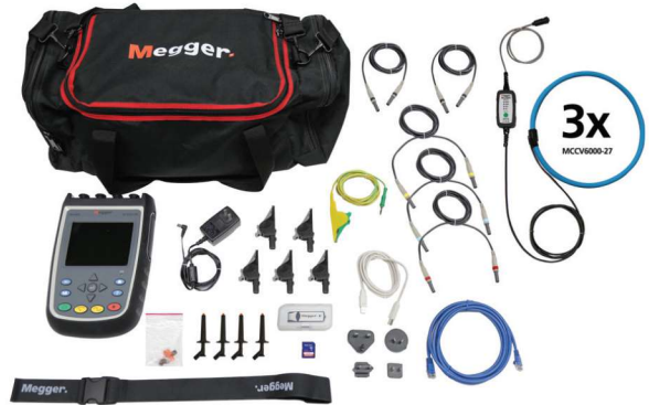
MPQ1000 Gold Kit C/N MPQ1000-G-KIT

Includes MPQ1000 analyzer, voltage leads, SD card, USB cable, ethernet cable, universal power adapter, soft-sided carry bag plus fuse adapters and hanging strap. Does not include current clamps.