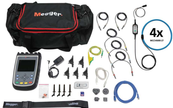
MPQ1000 Gold Plus Kit C/N MPQ1000-G-KIT-PLUS

Includes MPQ1000 analyzer, voltage leads, SD card, USB cable, ethernet cable, universal power adapter, soft-sided carry bag, plus hanging strap, voltage lead plunger clips, and 3 MCCV6000-18 (four range flex 18 cm ID) CTs