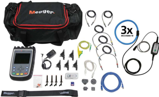
MPQ1000 Silver Kit C/N MPQ1000-S-KIT

Includes MPQ1000 analyzer, voltage leads, SD card, USB cable, ethernet cable, universal power adapter, soft-sided carry bag, plus hanging strap, voltage lead plunger clips, and 3 MCCV6000-27 (four range flex 27 cm ID) CTs