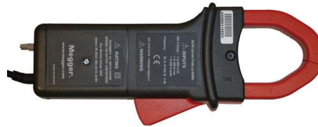
Hall Effect Current Clamp 600 A dc and 400 A ac (CP-600DC-ID)