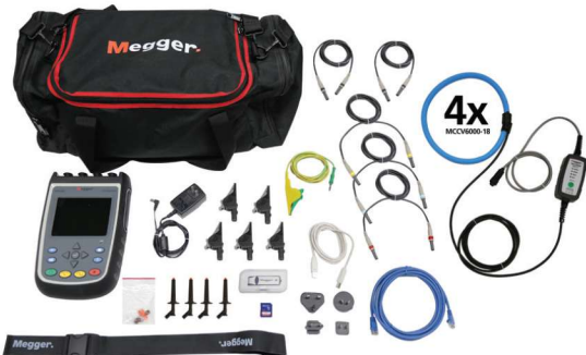
MPQ1000 Silver Plus Kit C/N MPQ1000-S-KIT-PLUS

Includes MPQ1000 analyzer, voltage leads, SD card, USB cable, ethernet cable, universal power adapter, soft-sided carry bag, plus hanging strap, voltage lead plunger clips, and 4 MCCV6000-27 (four range flex 27 cm ID) CTs