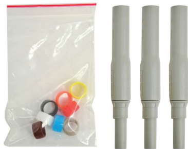
Optional Fuse Adapter Kit (1008-645)

Includes 4 adapters with multiple color straps.