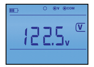
Live voltage is displayed when the V/A function is selected and test leads are connected to AC or DC voltage.