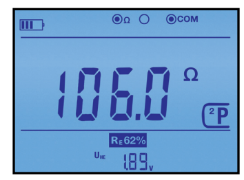
2P mode used for continuity and bonding checks – is active when the instrument is turned on.