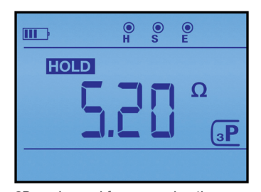
3P mode used for measuring the grounding system. The resistance of the injector electrode and the test voltage are also displayed.