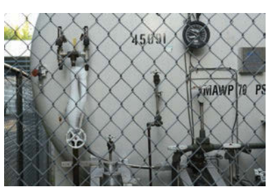
Difficult inspection sites